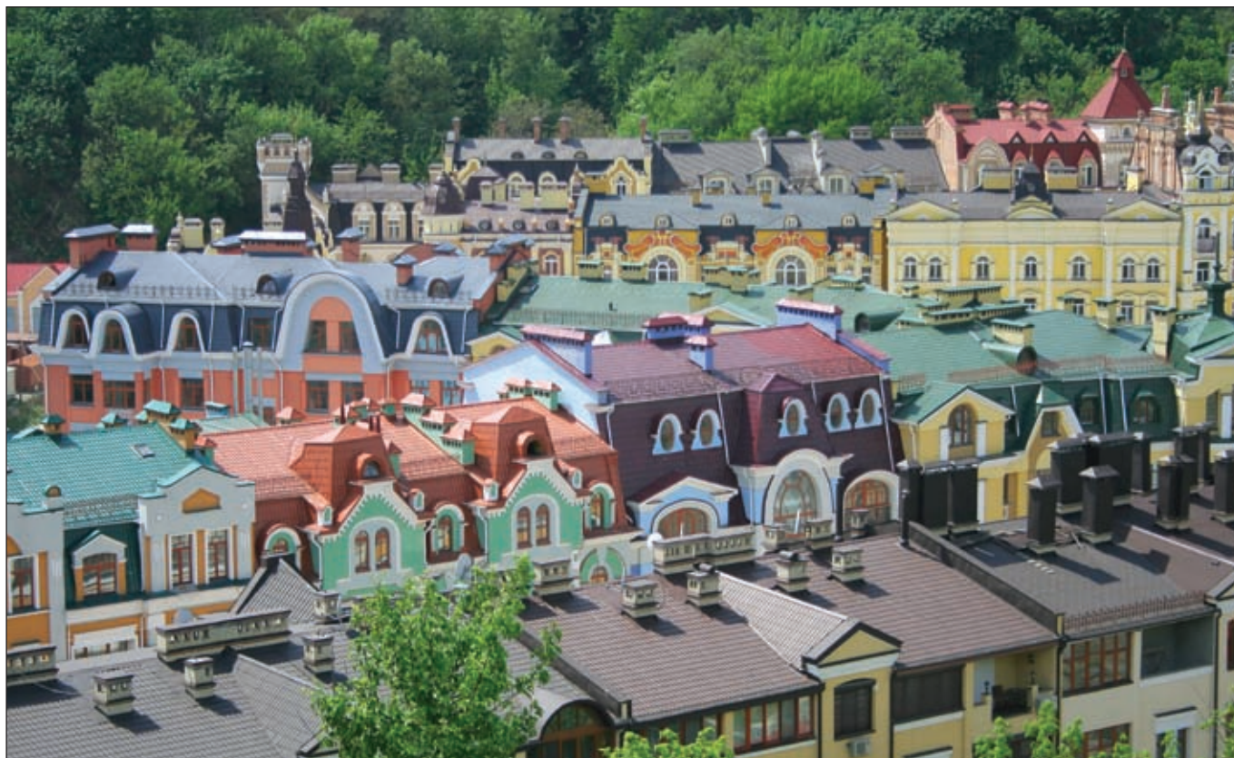
Colourful houses in downtown Kyiv